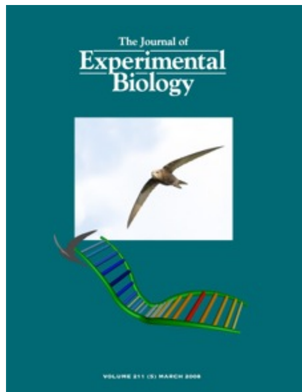
J. Exp. Biol. March 2008