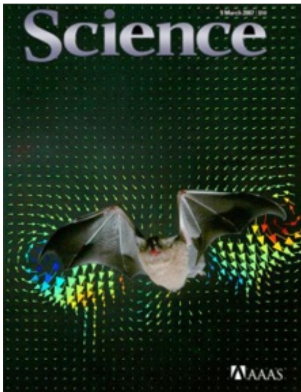
Science March 2007